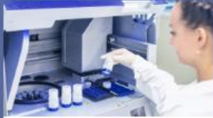
THE FACULTY OF NATURAL SCIENCES AND MATHEMATICS