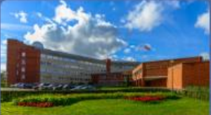
THE FACULTY OF SOCIAL SCIENCES