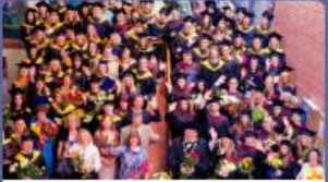
THE FACULTY OF HUMANITIES