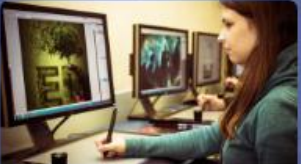
THE FACULTY OF MUSIC AND ARTS