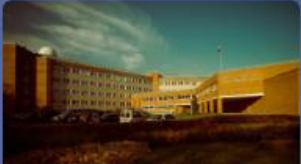
THE FACULTY OF EDUCATION AND MANAGEMENT